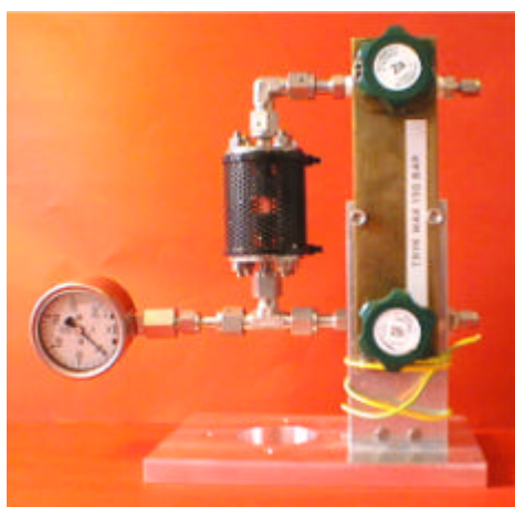
Photo showing the sapphire tube cell.

A system for obtaining Raman spectra of gases at high pressures has been constructed. In order to secure that a natural gas sample is totally representative, we have developed a gas-measuring cell suitable for measurements at high pressures, built up by stainless steel fittings (Swagelok) and a sapphire tube. Perfect tightness has been demonstrated up to 15.0 MPa A . The cell has been successfully used for obtaining Raman spectra of natural gas at high pressures. A picture of the so-called “Sapphire tube cell” is shown below.